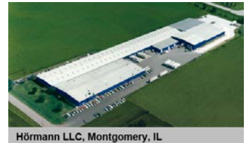
Hörmann LLC, Montgomery, IL