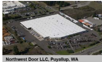
Northwest Door LLC, Puyallup, WA

Hörmann Northwest Door, LLC 19000 Canyon Road East, Puyallup, WA 98375-9746 Phone: 253-375-0700 Fax: 253-375-0800 Email: info@northwestdoor.com www.northwestdoor.com