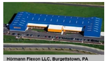
Hörmann Flexon LLC, Burgettstown, PA