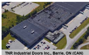
TNR Industrial Doors Inc., Barrie, ON (CAN)