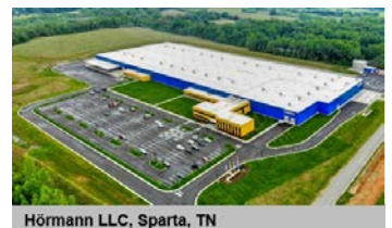
Hörmann LLC, Sparta, TN