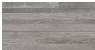
Aspen Gray (AGP)

The printed horizontal plank design creates depth, texture, and dimension.