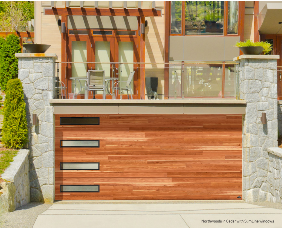
Northwoods in Cedar with SlimLine windows

The printed horizontal plank design on a ribbed section creates depth, texture and subtle dimension. A perfect complement to modern, mid-century modern, and traditional architectural styles.