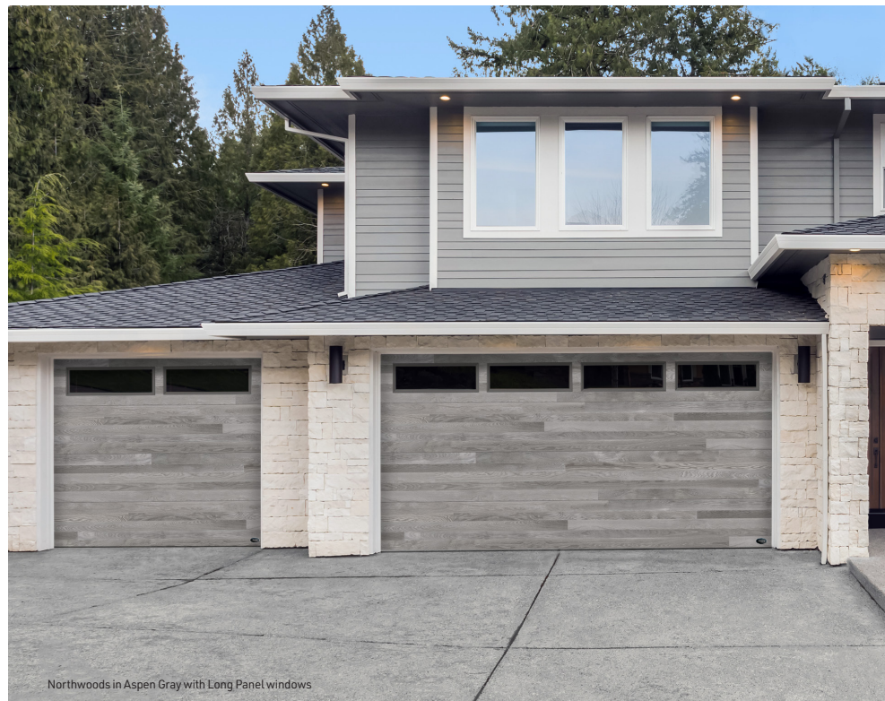
Northwoods in Aspen Gray with Long Panel windows

The multi-hued, digitally printed woodgrain pattern gives a more genuine wood appearance. Available with either traditional or Mosaic Window placement.